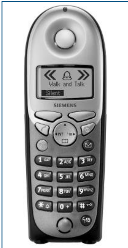
Gigaset 4000 Comfort